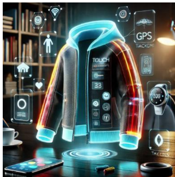
Figure 1. Smart clothing

Smart clothing is an innovative development consisting of intelligent garments with technological capabilities. These garments can connect with the human body and collect, transmit, and process various types of data (see Figure 1). They operate with the help of sensors, electronic components, and smart materials. Smart clothing is commonly used for health monitoring, tracking sports activity, studying environmental conditions, and even creating new approaches in the field of fashion.