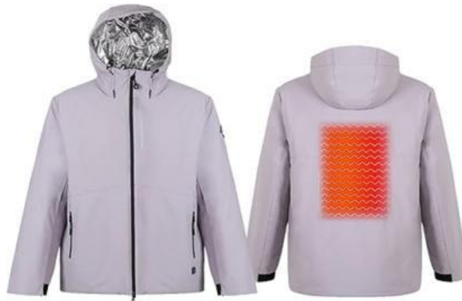
Figure 1 Smart clothing presented by Toyomo company

A new project developed by Indian engineer-designers has been introduced to the market. The heat-retention technology of the new thermal suit has been improved. The new smart clothing presented by TOYOMO is attracting attention with its simple appearance and ease of control (see Figure 1). The carbon fiber heating system warms up, while the thermal insulation effect of aerogel is three times higher than that of ordinary clothing.